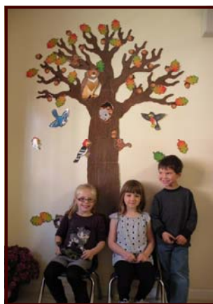
Welcome to Kindergarten