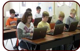
Sixth grade computer class