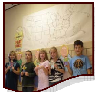
Third graders showing off their Flat Stanley project.