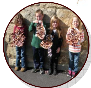
First Graders sporting leaf owls for their "Who is Special" project