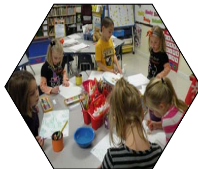
Painting leaves in Kindergarten