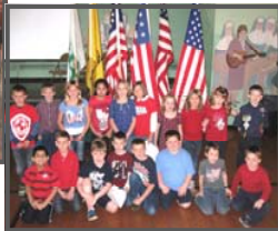
Veteran's Day Program