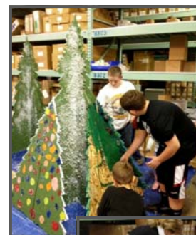
Students helping with the float