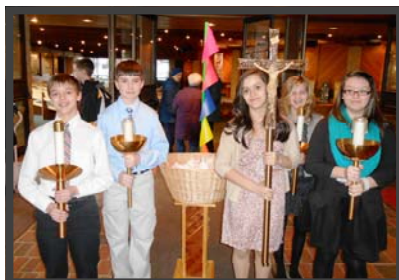
Celebrating CSW Mass