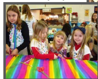
Lap Blankets for Nursing Homes