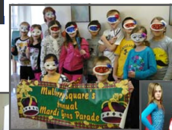
Mardi Gras with Mulberry Square Elder Care Residents