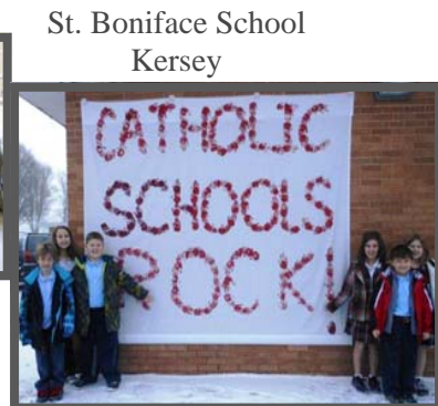
St. Boniface School Kersey