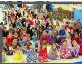
Divine Redeemer School Ford City