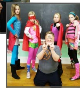
Super Heroes Celebrate