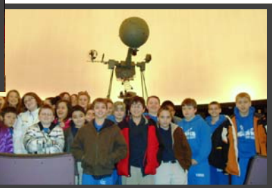
Planetarium Visit at CUP