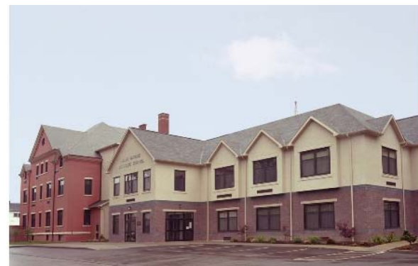
St. Patrick School, Franklin

The school offers a solid core curriculum along with art, music, and technology classes. Piano and instrumental lessons are available on site. They offer support services for students needing academic assistance. They emphasize Gospel values to highlight their character education efforts. They provide service opportunities for their students which enable them to reach out to the local and wider community. Two