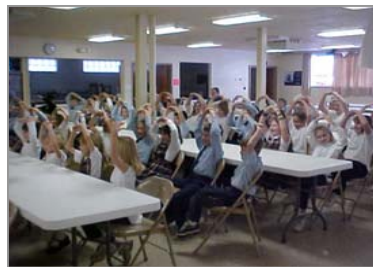
New Fitness Center

St. Boniface School offers special classes through Friday afternoon clubs. Some of these classes include the following; a German Club, Chess Club, Craft Club,