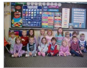
Kindergarten & Preschool