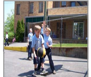
Playing hard at recess