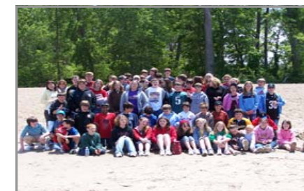
SSS Middle School visits Tom Ridges Environmental Center in Erie.