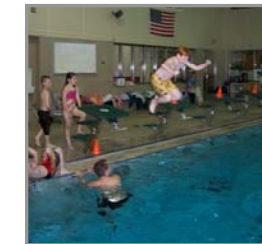
Swimming lessons at the YMCA