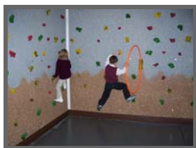
The Climbing Wall