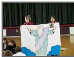
Students sharing a picture of Moses during a Catholic Schools Week presentation of the Exodus.