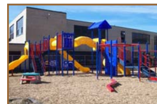
Seton's new playground