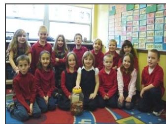
Grade 1-Pennies from Heaven campaign