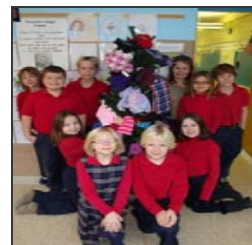
Grade 3-Mitten Tree Service Project