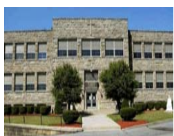
St. Marys Catholic Middle School

The Elk County Catholic School System (ECCSS) was incorporated in November, 2010. The system is a product of merging three Catholic schools in St. Marys, Pennsylvania: St. Marys Catholic Elementary School, St. Marys Catholic Middle School, and Elk County Catholic High School. All three schools are accredited by the Middle States Association of Colleges and Schools.