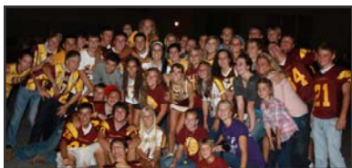
H.S. Juniors and Seniors