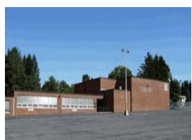
St. Marys Catholic Elementary