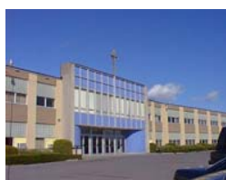
Elk County Catholic HS